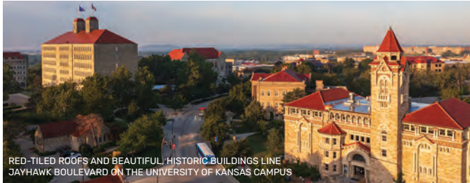
RED-TILED ROOFS AND BEAUTIFUL, HISTORIC BUILDINGS LINE JAYHAWK BOULEVARD ON THE UNIVERSITY OF KANSAS CAMPUS

In Lawrence, learning is a way of life. This small city in Douglas County, Kansas, is home to two major universities, a top-notch public school system, an award-winning public library, and seemingly limitless courses and classes for people in every stage of life. Lawrence boasts a highly educated workforce, a high concentration of entrepreneurs, a multicultural employee base, and rich diversity of thought and experience. More than 54.9% of our population (aged 25–64) have a bachelor's or higher degree, compared with 35% nationally. We place high value on education and training at all levels.