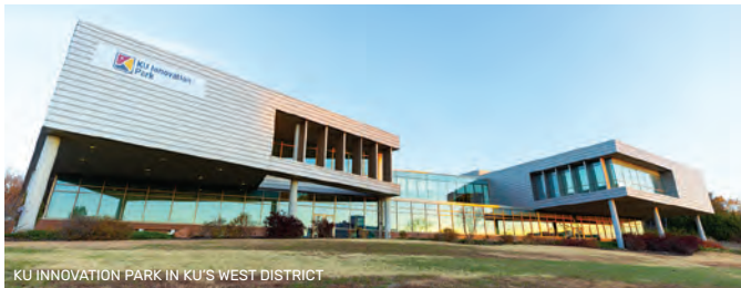
KU INNOVATION PARK IN KU'S WEST DISTRICT

The main campus of the University of Kansas, the state's flagship institution, is in Lawrence. Designated a "Very High Research Activity" university in the Carnegie Classifications, KU is among a distinct group of 38 public institutions in the Association of American Universities. KU has the largest concentration of life science research entities in the state of Kansas. KU researchers work at the cutting edge of science, education, business, engineering, and the arts and humanities to transform the way we understand and experience the world. The university's core research laboratories help corporate partners defray costs, extend capabilities, access expert scientific advice and services, and solve problems.