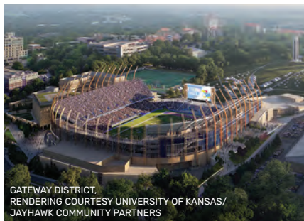
GATEWAY DISTRICT

KU football has its own storied legacy. As momentum for the future builds, exciting plans are underway for a new football stadium as part of the Gateway District, a transformational project on the northern edge of the KU campus that will provide academic and conference space, hospitality areas, and more.