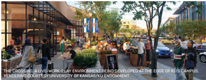
THE CROSSING, A LIVE-WORK-PLAY ENVIRONMENT BEING DEVELOPED AT THE EDGE OF KU'S CAMPUS, RENDERING COURTESY UNIVERSITY OF KANSAS/KU ENDOWMENT